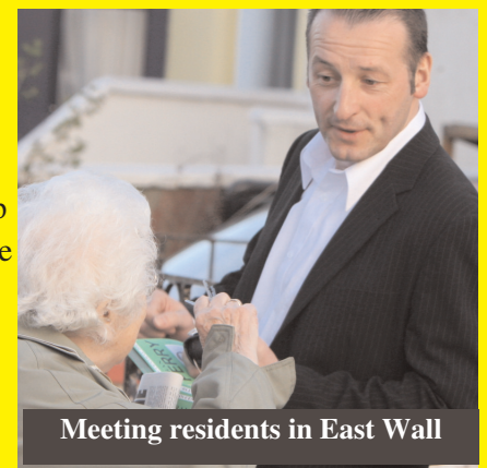
Meeting residents in East Wall

I believe that a redesign of the development could provide a similar amount of public housing of an acceptable quality and social mix and within the same timeframe.