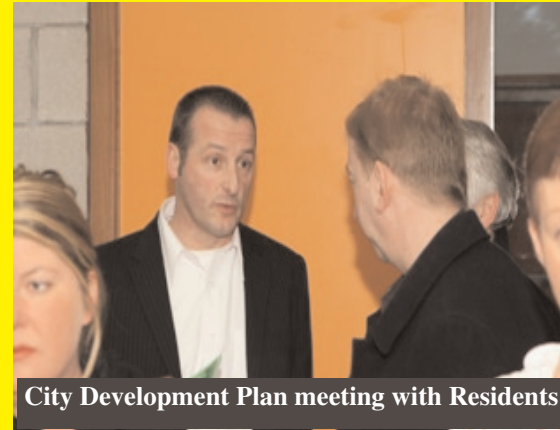
City Development Plan meeting with Residents

The Venue for An Bord Pleanála hearing has now been relocated to Croke Park. This is a welcome decision, as the original venue in Tallaght was unacceptable and inconvenient for locals wishing to attend. As a Councillor I will be making my contribution soon, supporting the concerns expressed by residents. The full text of my written observation is available on my website ( www.cieranperry.ie ), which will be updated with any further contributions.